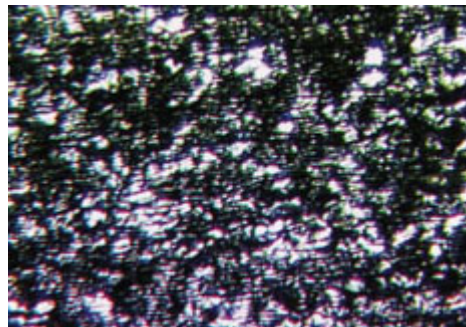
Figure 4 Cross Section of Paraffin Wax Modified With 3% Epolene Polymer