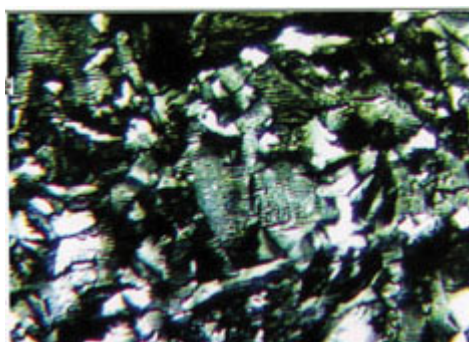
Figure 1 Cross Section of Paraffin Wax—No PE Added

To further explain the reason the physical properties of the paraffin wax improve with the addition of polyethylene, microphotographs of the wax blend samples were prepared. The microphotographs (see Figures 1–4) show the effect polyethylene has on the crystallinity of paraffin. For example, the unmodified paraffin (Figure 1) contains large pieces of crystalline material (white areas) and large pieces of amorphous material (black areas). At 0.5%, 1%, and 3% addition levels of polyethylene, a significant change is observed in that the large crystalline and amorphous areas become smaller and more uniform. This uniformity explains why the physical properties such as hardness, tensile strength, and percent elongation improve as the addition of polyethylene are increased.